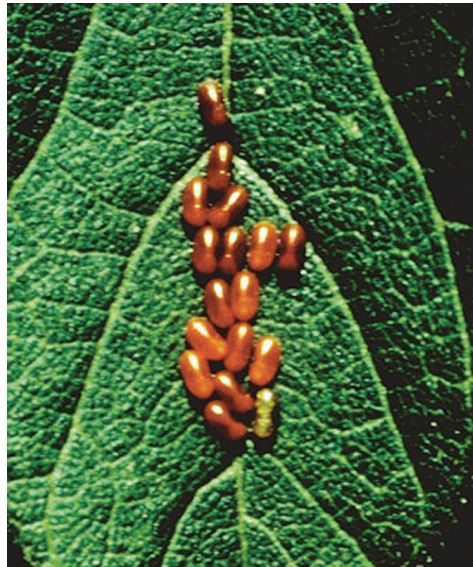
Figure 2: Boxelder bug eggs on leaf.

fall and winter days. They also may stain draperies and other light-colored surfaces and produce an unpleasant odor when crushed, but these are not major problems. They do not reproduce during this period. They may attempt to feed on house plants but do not cause any damage. On rare occasions, they have been reported to bite humans.