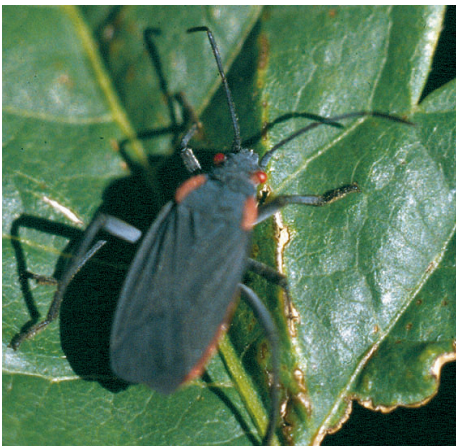
Figure 5: Goldenrain tree bug is sometimes confused with the boxelder bug.

female boxelder trees from a neighborhood, although this may not be practical or desirable. Because boxelder bugs usually overwinter near the trees that they feed on, the removal of one or two problem trees may help. Screening or sealing cracks or other entrances into the dwelling is important. Once boxelder bugs have entered the home, control becomes more difficult.