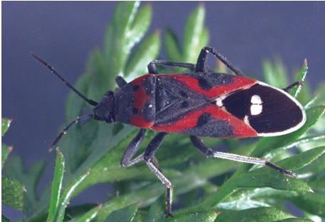
Figure 4: The small milkweed bug is a seed feeding bug that resembles the boxelder bug.