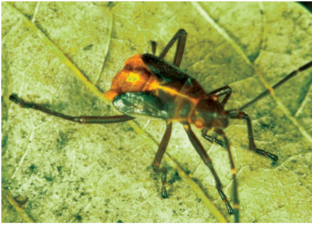
Figure 3: Boxelder bug nymph.