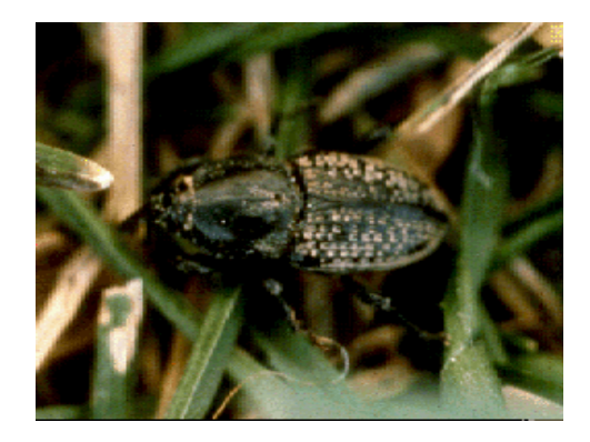
Figure 1: Denver billbug adult.