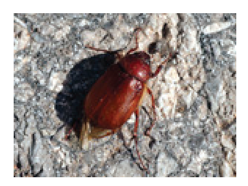
Figure 8: May/June beetle.