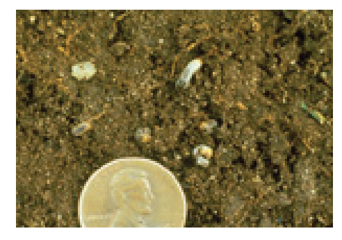
Figure 9: Black turfgrass ataenium larvae.