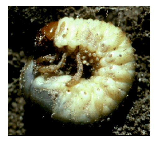
Figure 4: White grub larva.

complicated than the bluegrass billbug. Some of the insects overwinter as adults, but most remain in the larval stage and feed throughout spring. Egg-laying occurs throughout most of the growing season, peaking in June and July.