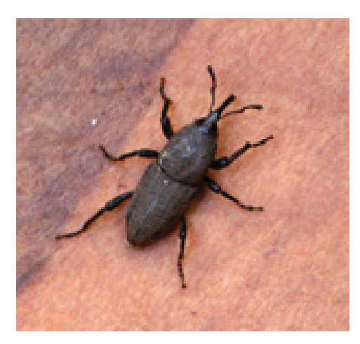
Figure 2: Bluegrass billbug adult.

as an adult in protected areas, such as under debris near building foundations or at the interface of turf and sidewalk. Eggs are produced and laid in late May, June and early July. Larvae develop over the course of several months. Peak larval injury occurs in late June and July. When full-grown, the larvae pupate a few inches deep in the soil. The adults emerge in two to three weeks, feed briefly and seek overwintering shelter. There is one generation per year.