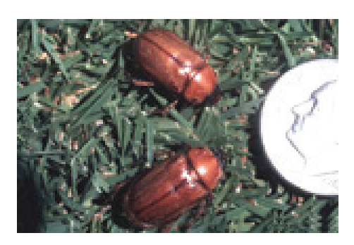
Figure 6: Masked chafer adults.

recycle nutrients in organic matter, such as dung. A few species, however, are important turf pests.