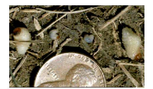
Figure 3: Denver billbug larvae.