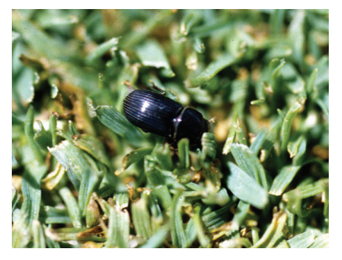
Figure 10: Black turfgrass ataenius larvae.