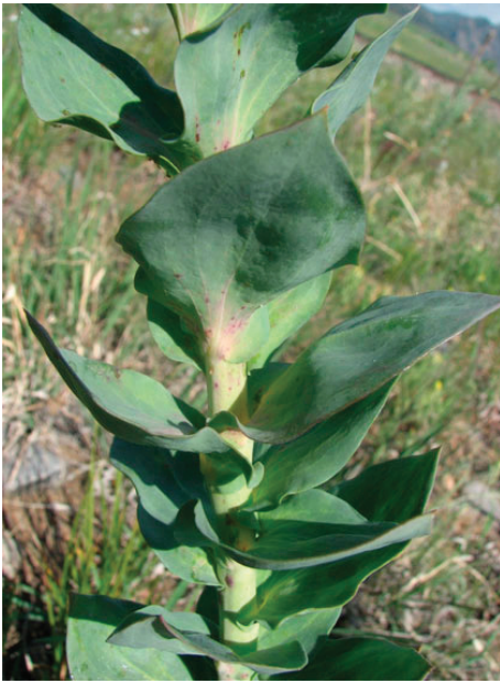
Figure 7: Dalmatian toadflax leaves usually are waxy, spade-shaped, and wrap around shoots.