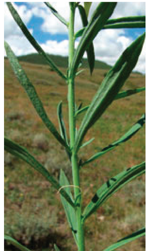
Figure 5: Yellow toadflax shoots and leaves; note narrow, linear leaf shape.