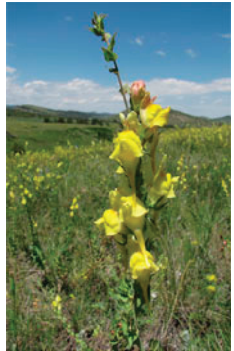
Figure 9: Dalmatian toadflax flowers.

A stem-boring weevil ( Mecinus janthinus ) and a root-boring moth ( Eteobalea intermediella ) also were released in Canada and the U.S. to control all species of toadflax. These species may help to control shoots and seed production as well as decrease root vigor, but data are