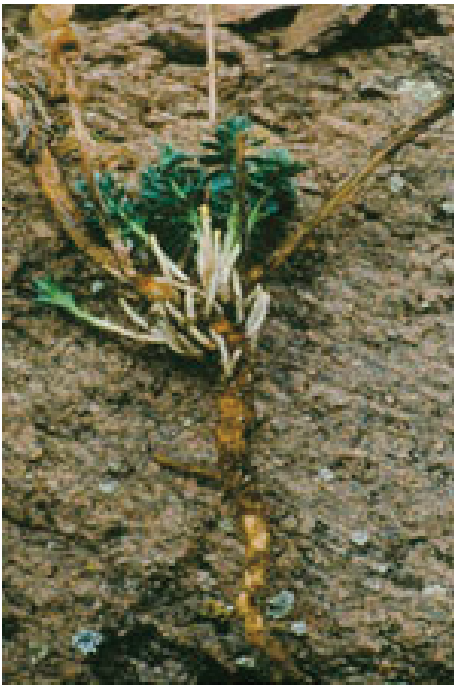
Figure 2: Mature Dalmatian toadflax shoot emergence in early spring; note well-developed deep taproot and lateral roots that were broken off during excavation.