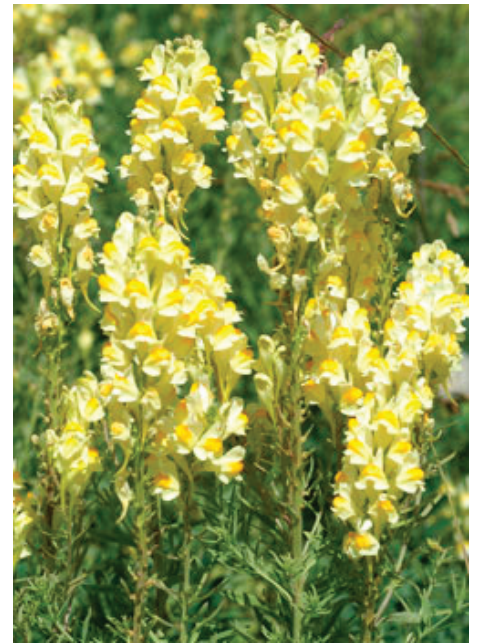
Figure 4: Mature yellow toadflax.

Dalmatian toadflax typically flowers beginning in late May or June in Colorado and may continue until fall, particularly if moisture is not limiting. Yellow toadflax begins to flower when shoots are from 16 to 24 inches tall, mid- to late May along the Front Range in Colorado, although at higher elevations (9,000 feet or more), flowering may not begin until late July. Yellow toadflax may not flower until fall under drought conditions. Flowers of both species are indeterminate, grow at the bases of upper leaves, are bright yellow with orange centers (not always in Dalmatian toadflax), and have a spur that is about as long as the rest of the flower (Figures 9 and 10). Yellow toadflax shoot phenology in any given patch may range from vegetative to flowering to seed set, depending on the time of season and environmental conditions (particularly moisture). This contributes to management difficulties.