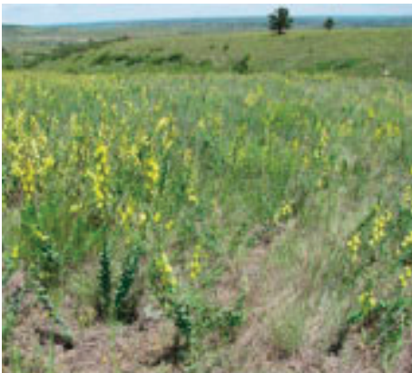
Figure 8: Dalmatian toadflax often dominates rangeland after invasion.

70 percent of crowns examined. Tordon applied alone at 2 or 4 pt/A controlled 53 percent and 70 percent of yellow toadflax, respectively, about one year after treatments were applied; however, when these rates were mixed with Overdrive at 6 oz product/A control improved to 97 percent and 94 percent, respectively. This experiment is being repeated to determine if improved control is consistent.