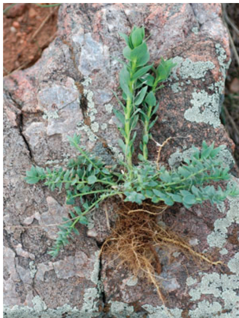
Figure 1: A second year Dalmatian toadflax plant; note prostrate shoots that survived the winter and new shoots that emerged from roots.

Yellow toadflax is native to south-central Eurasia where it was used for fabric dyes and for medicinal purposes. It was imported into North America in the late 1600s as an ornamental and for folk remedies. It was widely distributed in North America by the