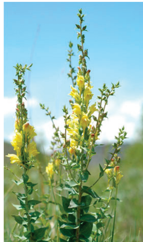
Figure 6: Mature Dalmatian toadflax.

Yellow toadflax appears to be more difficult to manage than Dalmatian toadflax. In Colorado, control from Tordon 22K applied at flowering has been most consistent and typically, 4 pt/A is recommended. Yellow toadflax usually recovers from a single application. For example, Tordon applied at 4 or 8 pt/A controlled 13 percent and 69 percent of yellow toadflax three years after treatments were applied. Other research conducted in Colorado suggests that yellow toadflax control may be improved if Tordon is applied over three consecutive years,