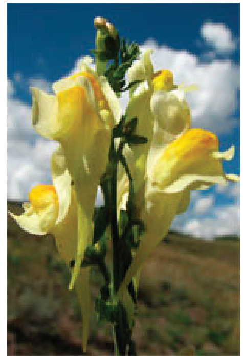
Figure 10: Yellow toadflax flowers.

unavailable to document their effects. Several of these classical biocontrol agents are available from the Colorado Department of Agriculture Insectary in Palisade. Very few published studies are available to determine whether grazing by livestock will effect any control of Dalmatian or yellow toadflax.