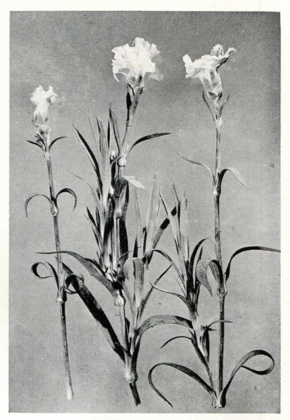
Station horticulturists have conducted research which has allowed carnation growers to double the yield per square foot of bench space.

Research scientists have proven that the Burbank variety of potato can be grown successfully in Colorado, regardless of soil type, providing proper cultural practices are followed.