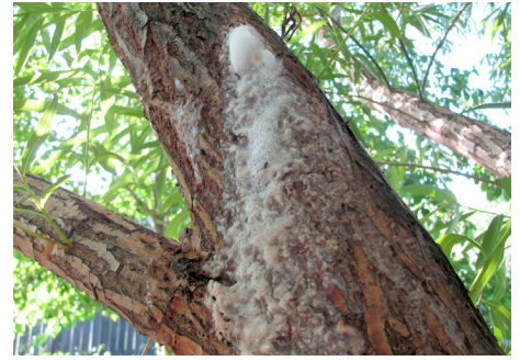
Figure 9. Globe willow with alcohol flux. (W.R. Jacobi).

Several insects commonly visit the oozing slime or alcohol flux and feed on it. Various flies and sap beetles often are seen on the slime. Larval stages of these Insects may develop within the wounded area. Among the most striking Insects that visit oozing slime are bumble flower beetles, a hairy species of June beetle that sometimes clusters in large numbers. None of the insects that visit slime flux wounds are known to transmit the bacteria and there is no need to control them. Alcohol flux attracts wasps and bees which can be a nuisance to people allergic to wasp/bee stings.