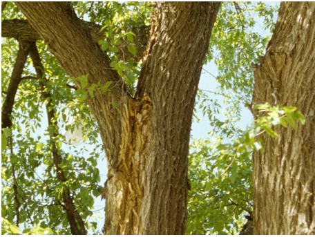
Figure 2. Wetwood discoloration at branch crotch on American elm. (W.R. Jacobi).