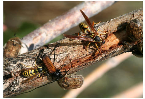
Figure 6. Wetwood or alcohol flux slime with visiting wasps and bumble flower beetles. (W. Cranshaw).

Recently transplanted trees may ooze slime or have alcohol flux if roots are not established and cannot supply adequate water. Fertilizing wetwood-infected trees is only recommended if the tree shows nutrient deficiencies.