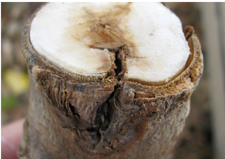
Figure 5. Wet wood induced canker on a nursery grown cottonwood. (W. R. Jacobi).

in the cambium and kills the cambium causing cankers. The xylem is discolored between the central core of wet wood and the cambium so it is assumed these disease symptoms are related to the same cause.