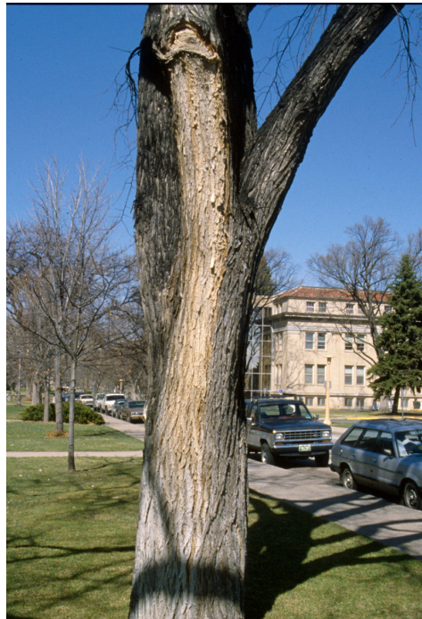
Figure 1. Discoloration of bark of American elm affected with wetwood.

Symptoms of wetwood disorder include a yellow-brown discoloration of the wood, generally confined to the central core of the tree. This affected wood is wetter than surrounding wood and is under high internal gas pressure. The buildup of gas pressure is a by-product of bacterial activity. In elms, the gas consists mainly of methane and nitrogen. The highest gas pressure occurs in elms from May through August. The gas pressure and high moisture content cause an oozing or bleeding of slime, from pruning cuts, through bark cracks and branch crotches. The ooze is foul-smelling, slimy, and colonized by yeast organisms when exposed to air. When the slime dries, it leaves a light gray to white crust