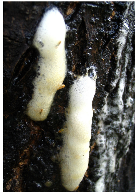
Figure 8. Milky froth of alcohol flux. (J. Walla).