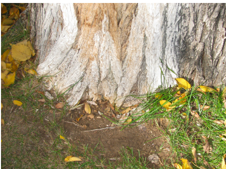
Figure 4. Base of tree where wetwood slime has killed the grass. (W.R. Jacobi).