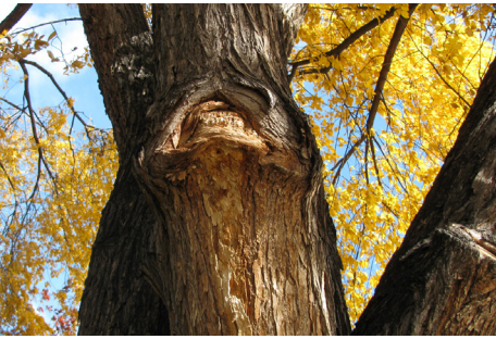
Figure 3. Old pruning cut with wetwood slime inhibiting callus growth. (W.R. Jacobi).