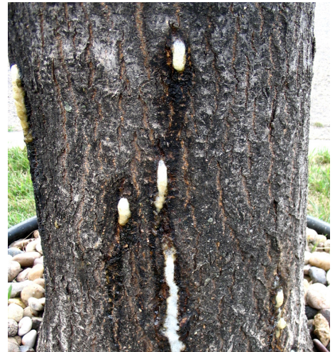
Figure 7. White ash with milky alcohol flux. (J. Walla).