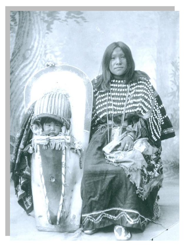
Ute woman and child

For at least the last 14,000 years, people have made the Colorado plains and mountains their home. The first peoples, Paleoindians, followed their food supply across the prairie, hunting mammoth, mastodons, and giant bison. Their skilled hunting of large game required them to live and work together in close cooperative groups. As the giant mammals died off, these indigenous peoples developed technology to hunt smaller game. Some began to plant crops, requiring them to become semi-nomadic, while others continued their nomadic hunter-gatherer lifestyle.