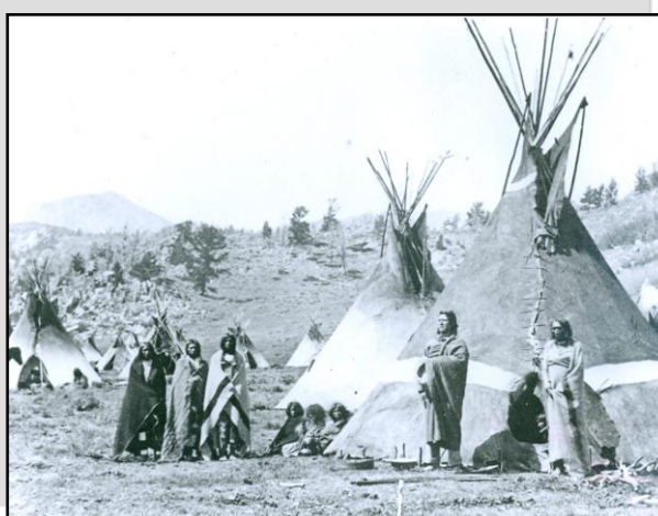
Arapaho Camp c. 1800s

We welcome corrections and suggestions. Revisions will be incorporated into our online interactive version at coloradowest.auraria.edu.