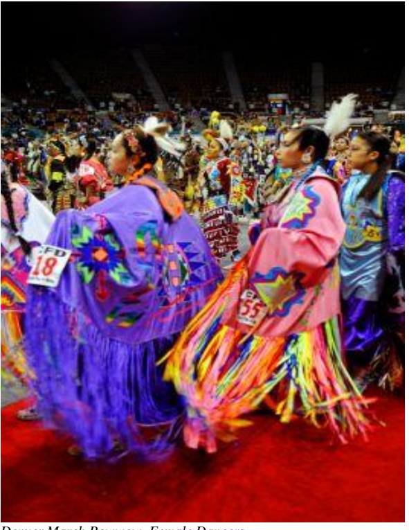
Denver March Powwow, Female Dancers