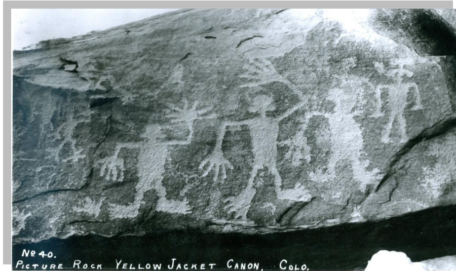
Petroglyph: "Picture Rock," Yellow Jacket Canon, Canon of the Ancients