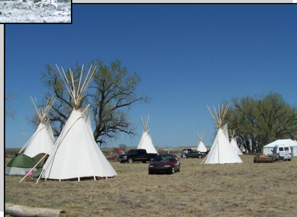
Camp at Sand Creek Massacre Historic Site, 2007