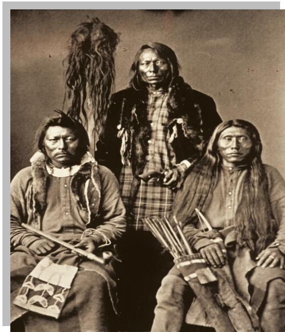
Ute Warriors