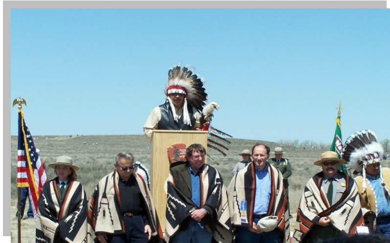
Sand Creek Massacre Historic Site Dedication, 27 April 2007