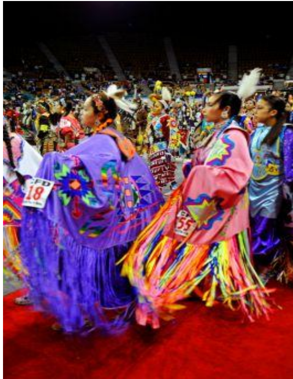
Denver March Powwow, Female Dancers