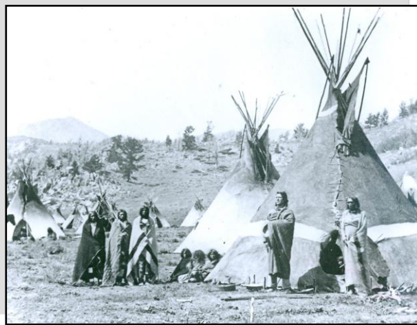
Arapaho Camp c. 1800s

We welcome corrections and suggestions. Revisions will be incorporated into our online interactive version at coloradowest.auraria.edu .