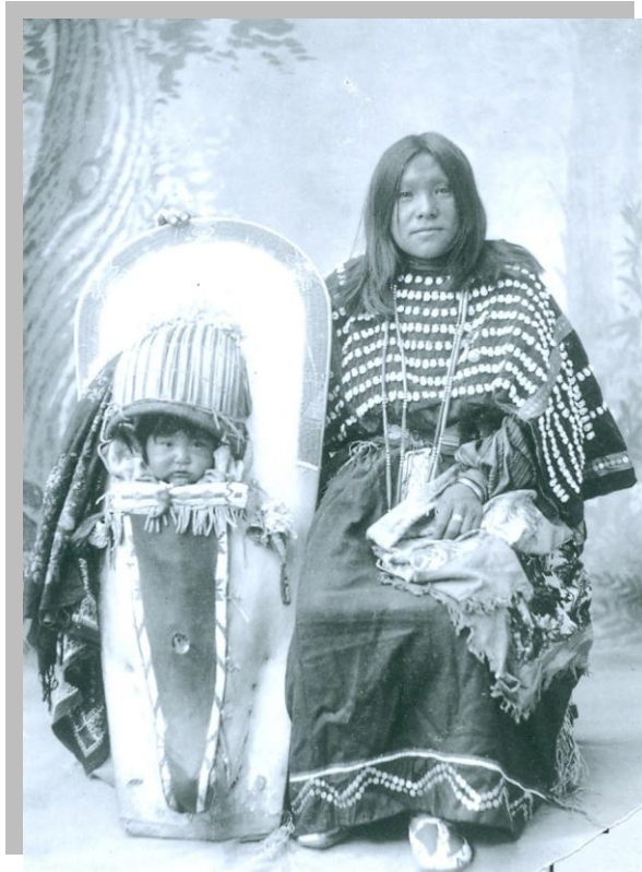
Ute woman and child

For at least the last 14,000 years, people have made the Colorado plains and mountains their home. The first peoples, Paleoindians, followed their food supply across the prairie, hunting mammoth, mastodons, and giant bison. Their skilled hunting of large game required them to live and work together in close cooperative groups. As the giant mammals died off, these indigenous peoples developed technology to hunt smaller game. Some began to plant crops, requiring them to become semi-nomadic, while others continued their nomadic hunter-gatherer lifestyle.