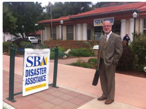
Disaster Assistance Center in Manitou Springs, September 2013

If a federal disaster has been declared, you – as a person and business – should register with both FEMA and the Small Business Administration (SBA). FEMA wants to know how many people have been impacted and what their insurance situation is. FEMA, however, does not deal with businesses. For any business-related support, you will need to register with the SBA, even if you don't know if you want a loan. Your SBDC consultant can help you figure out whether applying for a physical damage or economic impact disaster loan makes sense for your business. Even if you don't know whether you need any help, you should register with FEMA and SBA.