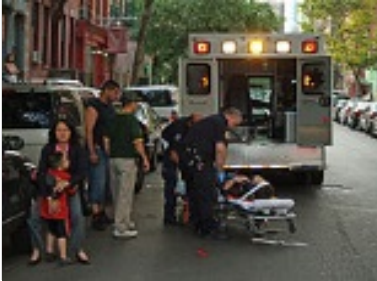
A woman collapsed on 7th street in the East Village when she was with her family. Emergency medical technicians arrived and took her to the hospital as her mother and son stand nearby hugging. 08/27/2008

In business, just as in life, we celebrate our successes and face our upsets. However, to be able to deal with emergencies and disasters in a prepared way, we need to get clear on what constitutes an emergency versus a disaster and how to handle the situation from a business perspective.