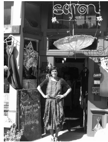
Safron of Manitou: Reopening the store and a major sale immediately following the flash flooding in Manitou Springs of August 9, 2013

These are just some sample questions to get you thinking about potential risks and the impact they may have on your business. The next sections in this guide will help you organize your thoughts and put them on paper.