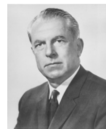
Sen. Robert T. Stafford

The Stafford Act (§401) requires that: "All requests for a declaration by the President that a major disaster exists shall be made by the Governor of the affected State." The governor's request is made through the regional FEMA/Emergency Preparedness and Response (EPR) office. State and federal officials conduct a Preliminary Damage Assessment (PDA) to estimate the extent of the disaster and its impact on individuals and public facilities. Normally, the PDA is completed prior to the submission of the governor's request. However, when an obviously severe or catastrophic event occurs, the governor's request may be submitted prior to the PDA. Nonetheless, the governor must still make the request.