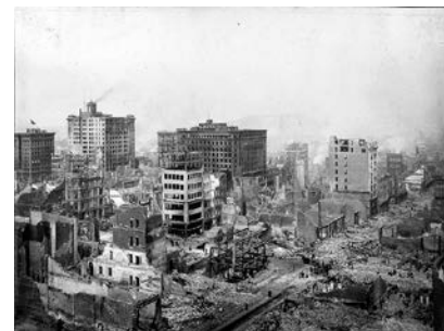
Ruins from the 1906 San Francisco earthquake, remembered as one of the worst natural disasters in United States history.