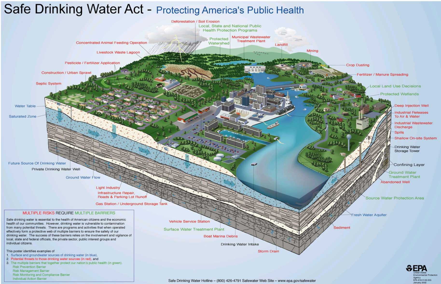
Figure 2. Examples of Potential Contaminant Sources and How Contaminants Can Enter Your Source Water.