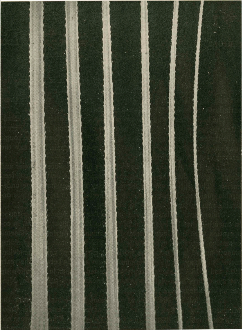
Fig. 1. Awn of Rough-Awned Barley.—Notice the rough, saw-like, barbed awn found on varieties such as Trebi and Coast which are commonly grown on irrigated land for feed.