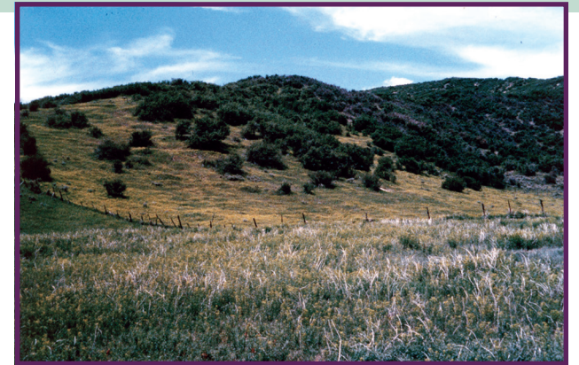
Leafy spurge site in Rio Blanco County before beetle release (1989)

The leafy spurge project has had much success in its efforts to control the leafy spurge throughout Colorado. The Aphthona beetles are great examples of how biological control can work. To date there have been thousands of successful release sites and over a million acres reclaimed. Research on this system is ongoing, not only to ensure continued success, but to increase the success rate and reclaim more of Colorado's agricultural and recreational areas.