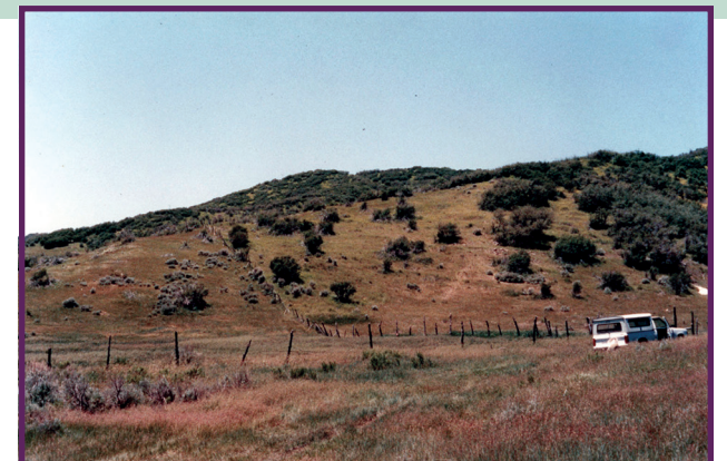
Leafy spurge site in Rio Blanco County after beetle release (1999)