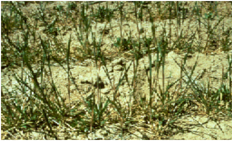
Figure 3: Wheat plants damaged by the Russian wheat aphid.