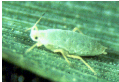
Figure 1: The Russian wheat aphid.

Winged aphids infest late-maturing winter wheat and spring grains but not corn, millet or sorghum. They also infest a number of cool-season grasses, particularly wheatgrasses. Damage to newly seeded grasses can be significant.