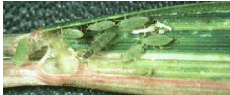
Figure 2: Discoloration caused by the Russian wheat aphid.

These grasses serve as alternate hosts for RWA during the period between grain harvest and the appearance of new wheat in the fall. Volunteer wheat and barley also may become infested. Volunteer wheat and barley are important sources of RWA for the new fall crop as soon as it emerges. Weather conditions that favor cool season grasses and volunteers will increase the number of aphids infesting the new wheat crop in the fall.