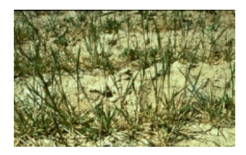
Figure 3. Wheat plants damaged by the Russian wheat aphid.