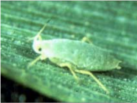
Figure 1. The Russian Wheat Aphid.