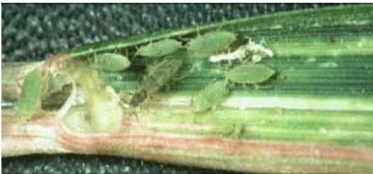
Figure 2. Discoloration caused by the Russian Wheat Aphid.