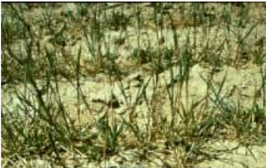
Figure 3. Wheat plants damaged by the Russian Wheat Aphid.