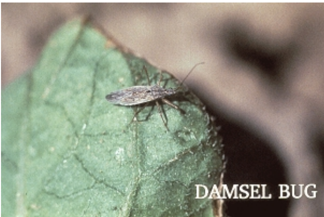
Figure 3e: Damsel bug.