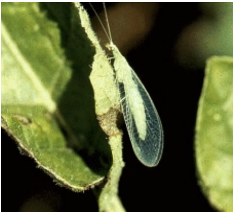
Figure 3c: Lacewing adult.