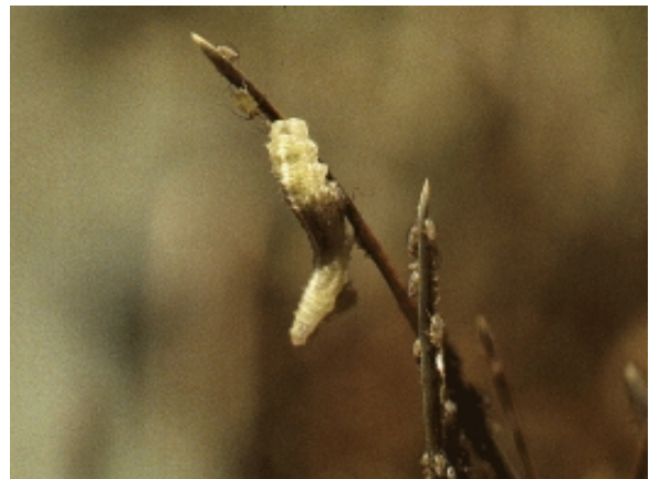
Figure 3f: Syrphid fly larvae feeding on aphids.