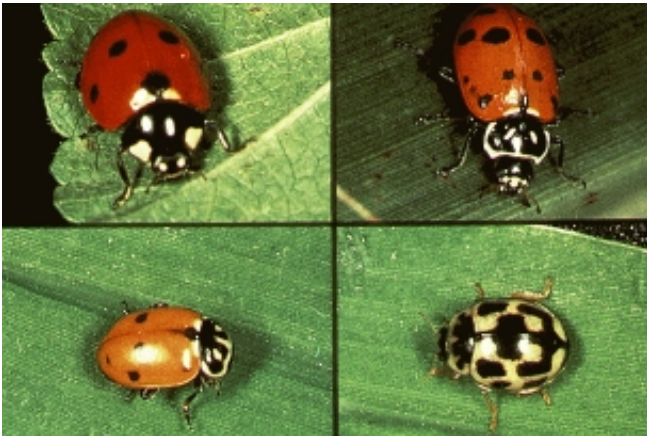
Figure 3a: Lady beetle adult.