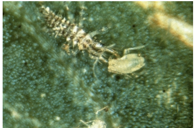
Figure 3d: Lacewing larva attacking aphid.