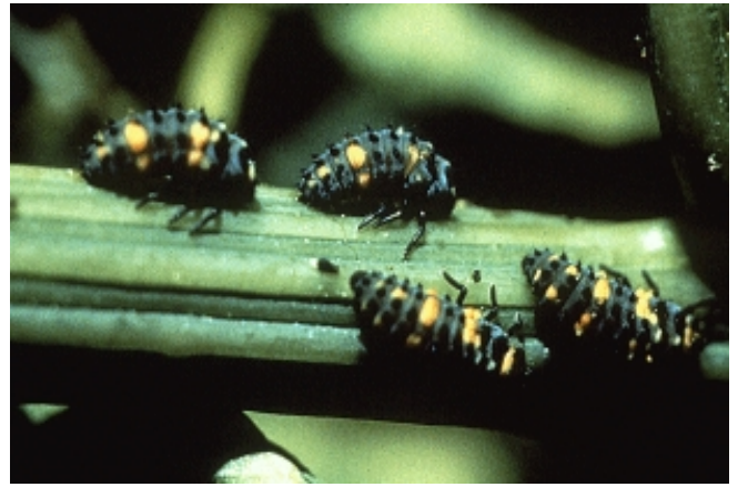
Figure 3b: Lady beetle larva.