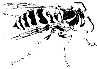
Figure 1. Yellow jacket.

( Vespula spp.) are banded yellow or orange and black and are commonly mistaken for honeybees (Figure 1). Yellow jackets typically nest underground in rodent burrows but occasionally nests can be found in dark enclosed areas of a building such as a crawl space or wall void. Among the yellow jackets are a few species that can become serious nuisance pests, particularly late in the season when large numbers are present and scavenging.