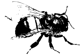
Figure 5. Honeybee.

Honeybees feed on nectar and pollen and do not scavenge garbage. The honeybee is an extremely important and beneficial insect due to its production of honey and other products, as well as