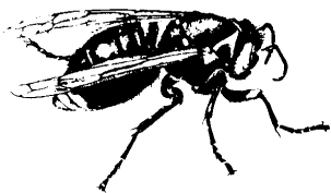
Figure 2. Bald-faced hornet.

Hornets ( Dolichovespula spp.) produce very large, grey nests in trees, shrubs or under external eaves of homes (Figure 2). The common bald-faced hornet is rather stout-bodied, dark colored, and marked with white stripes. Another common species of hornet is marked with yellow and resembles a large species of yellow jacket. Because of the large nest size and their conspicuous location, hornets often cause particular concern. However, rarely are people stung by hornets unless the nest is disturbed.