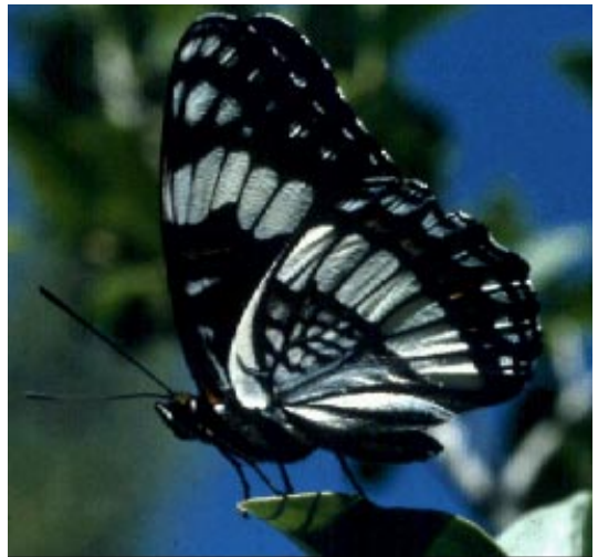
1. Weidemeyer's Admiral.