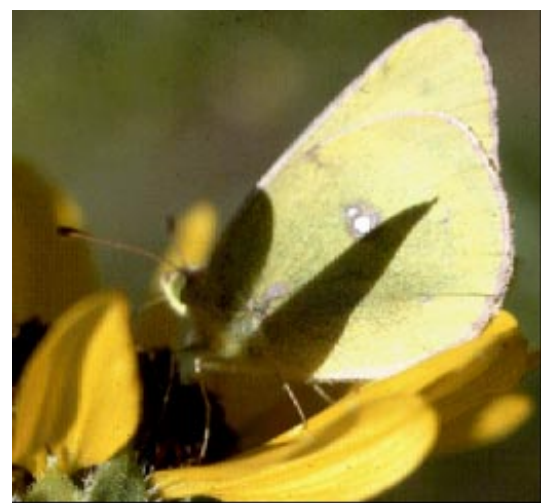
4. Orange sulphur.