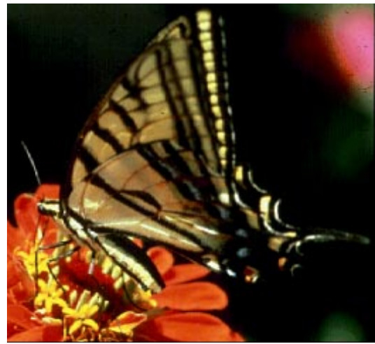
3. Western tiger swallowtail.