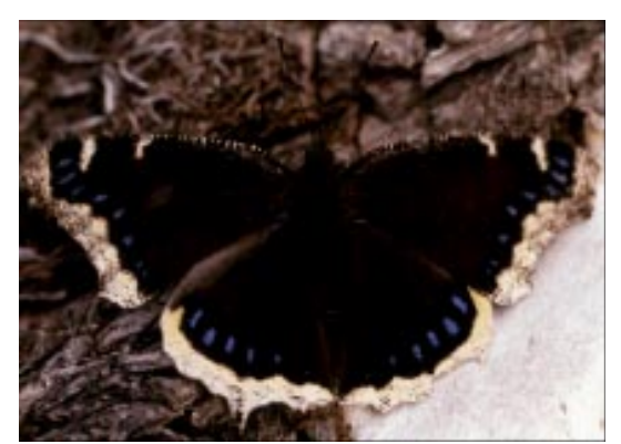
2. Mourning Cloak.