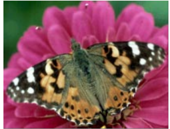
5. Painted lady.