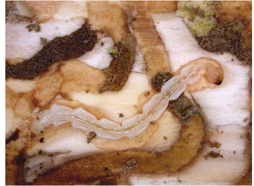
Larva of the emerald ash borer.