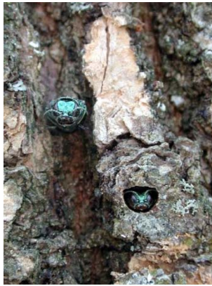
(left) Emerald ash borer adults in process of emerging from trunk.