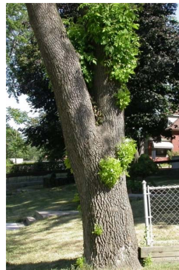
An ash tree that is showing epicormic branching on the trunk. Epicormic branching occurs when normal movement of nutrients and water is disrupted, such as occurs with the wounding produced by emerald ash borer.

This is because most of the insecticides used for EAB control act systemically—the insecticide must be transported within the tree. In other words, a tree must be healthy enough to carry a systemic insecticide up the trunk and into the branches and canopy. When EAB larvae feed, their galleries injure the phloem and xylem that make up the plant’s circulatory system. This interferes with the ability of the tree to transport nutrients and water, as well as insecticides. As a tree becomes more and more infested, the injury becomes more extensive. When damage has progressed too far, insecticides can no longer move within the tree in a manner to provide effective EAB control.