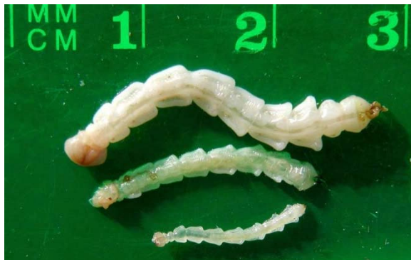
Emerald ash borer larvae. The larvae are minute after egg hatch but grow steadily through the summer.

they prepare for overwintering by tunneling a bit deeper into the sapwood to produce the overwintering chamber.