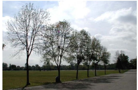
Ash trees showing advanced thinning due to effects of emerald ash borer feeding injuries. This photograph was taken in Michigan in 2002, the first year emerald ash borer was detected in North America.

Unfortunately the species of ash that are native to North America have very little resistance to this new pest and emerald ash borer is devastating to the kinds of ash trees grown in the state. In the Midwest and eastern areas of North America where this insect has been present for several years, EAB has already killed many millions of ash trees. It is expected that emerald ash borer will ultimately kill almost every unprotected ash tree presently growing in North America.