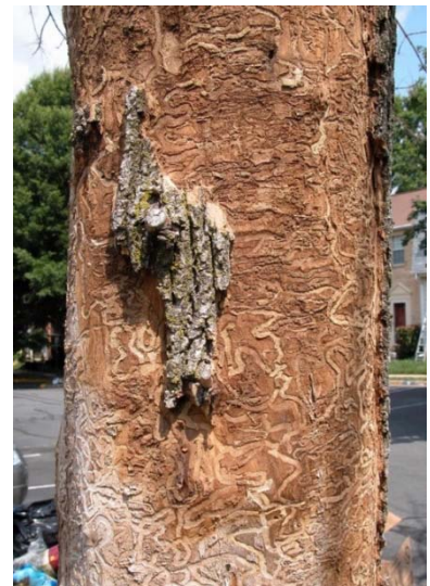
Extensive larval tunneling in an ash tree killed by emerald ash borer.