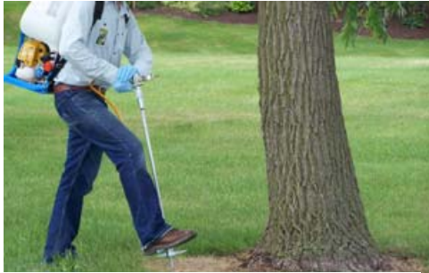
A systemic insecticide being injected into the soil near the base of a tree.

(azadirachtin) can only be used for EAB control when injected. Imidacloprid, most commonly used as a soil treatment for EAB control, can also be trunk injected (IMA-jet, Imicide, Pointer®, Zytect Infusible).