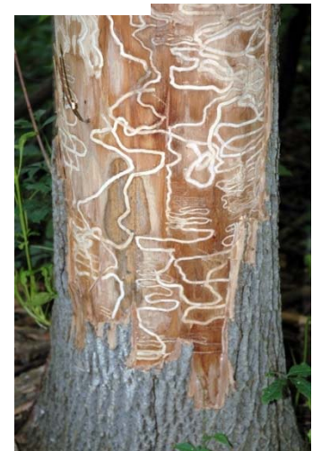
Larval tunnels produced by emerald ash borer. Such wounds interfere with the movement of water, nutrients – and systemic insecticides.