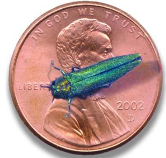
Adult of the emerald ash borer.

Why should I try to control emerald ash borer? Emerald ash borer (EAB), Agrilus planipennis , is an extremely destructive insect of ash trees ( Fraxinus species), including the kinds of ash (green ash, white ash) that are widely planted in Colorado. It is far more damaging to trees than any other insect that previously has been found in the state and, as populations of the insect increase in the infested areas, it very likely ultimately will kill any unprotected ash trees.