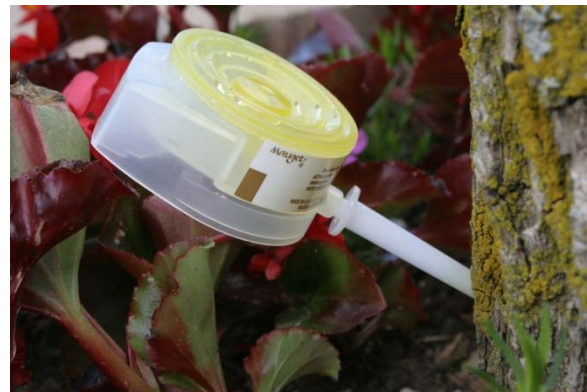
Trunk injection using the Mauget system. For emerald ash borer control this is usually used to apply the insecticide Imicide (imidacloprid).

Insecticides can be sprayed on the trunk, branches and (depending on the label) foliage to kill adult EAB beetles as they feed on ash leaves, and newly hatched larvae as they chew through the bark. Thorough coverage is essential for best results. Products that have been evaluated as cover sprays for control of EAB include some specific formulations of permethrin, bifenthrin, cyfluthrin, and carbaryl. Protective cover sprays are designed to prevent EAB from entering the tree and, unlike the control options with systemic activity, will have no effect on larvae feeding under the bark.