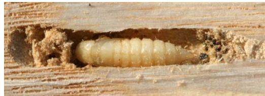
Pupa of the emerald ash borer.

In spring it will transform to the pupal stage, during which it transitions to the ultimate adult form.