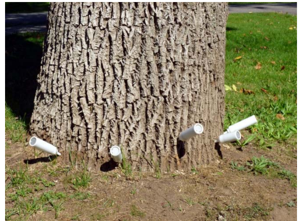
Trunk injection using the EcoJet system, which applies the emerald ash borer treatment TreeAzin® (azadirachtin).

The length of time these trunk injected insecticides can provide control varies by product. Imidacloprid trunk injections can provide control for a single season, as do the more commonly used soil applications of this product. At the other extreme, TREE-age® (emamectin benzoate) has been shown to consistently provide a very high level of EAB control for two years following application. TreeAzin® (azadirachtin), a product more recently marketed and used in the U.S., seems to provide intermediate persistence, showing some ability to control EAB larvae the year following application.