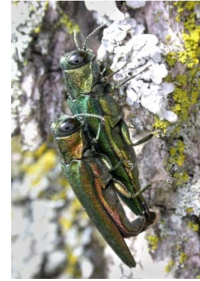
(right) Mating pair of emerald ash borers.

They then move to the crown of the tree where they feed on ash leaves, making small cuts along the edges of the leaves. After about a week of feeding, the now mature adults will begin to mate and a few days after mating females will begin to lay eggs. Eggs are laid on