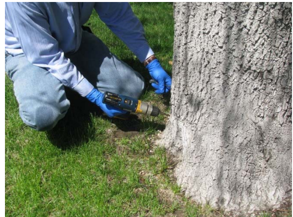
Trunk injections require holes be drilled into the base of the tree. The insecticide is then injected into these openings.

Trunk injected insecticides often can move rapidly into and through plants. Thus they are often best applied at some point after EAB adults have begun to emerge, are feeding on leaves, and are beginning to lay eggs. However, since all the insecticides used