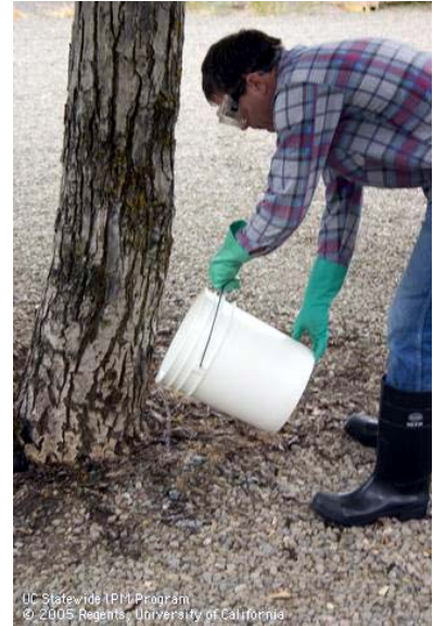
An application of a systemic insecticide being applied as a soil drench to the base of a tree.

The systemic insecticide dinotefuran (Safari®, Zylam®, Transtect®) can be applied as a coarse spray onto the trunk. It is a highly water soluble insecticide and is quite mobile in plants, which allows it to be absorbed through the bark where it can then be moved through the tree to provide control. Under favorable