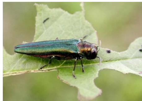
Emerald ash borer adult and associated chewing injury. Adults feed on leaves before they lay eggs and systemic insecticides can kill them during this period.