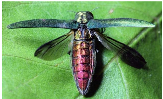
Adult of the emerald ash borer with wings spread showing the purple abdomen.

possible that a few may fly several miles if the right conditions come together. This natural spread will cause the present outbreak of EAB to expand beyond Boulder in the next few years to progressively encompass the areas of the state within the South Platte Drainage. This includes the greater Denver Metro area, Fort Collins, Greeley and all the communities further downriver.