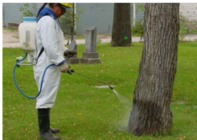
A systemic insecticide (dinotefuran) being applied as a non-invasive trunk spray.