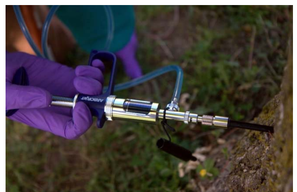
Trunk injection using the Arbor-jet system. For emerald ash borer control this is usually used to apply the insecticide TREE-Age® (emamectin benzoate).