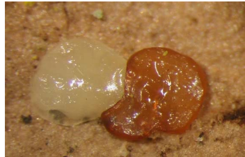
Emerald ash borer eggs. Eggs are laid on bark and originally are white, darkening within a couple of days.

Eggs hatch in about a week and the tiny, newly hatched larvae burrow through the bark. They enter and begin to feed on the tissues under the bark, the phloem, cambium and outer sapwood where they spend all of their larval life. During the course of feeding the larvae produce meandering galleries that progressively widen as the larvae grow. Ultimately the gallery produced by a single larva may range over an area ranging from 4 to 20" (10-50 cm) in length. Larvae feed until cooler fall temperatures arrive, when