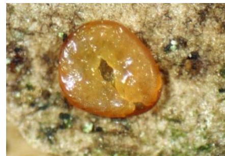
Emerald ash borer egg just prior to hatch. After hatch the larva will begin to tunnel into the tree, ultimately settling below the bark where it spends most of its life.