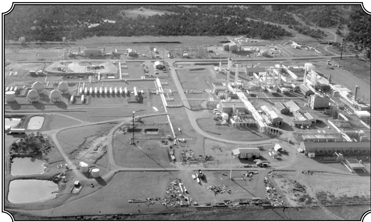
WILLIAMS GAS PROCESSING PLANT, IGNACIO, COLORADO