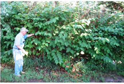
Japanese Knotweed in Morrison, Colorado. Contact the Colorado Department of Agriculture to report a sighting.