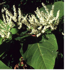
Japanese knotweed: showy flowers and ovate leaves.