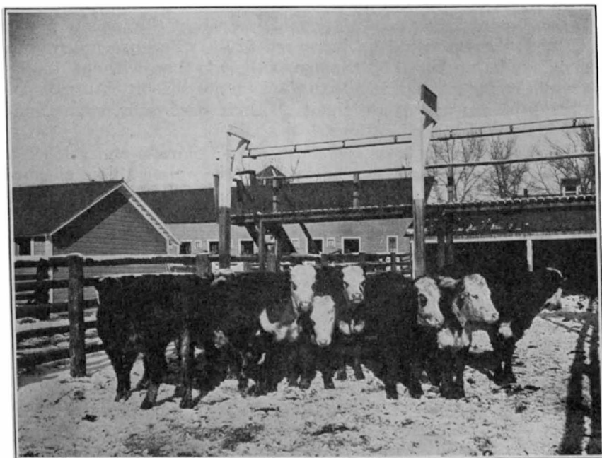
The silo will enable the farmer to feed out his own stock and thereby increase his profits

laid on the ground 82 percent of the total weight and 55 percent of the dry matter is lost. The Indiana Experiment Station has found that in feeding a carload of steers, 38¾ acres were required to grow the feed needed for 150 days when corn, oil meal, oat straw and stover were fed. When corn and clover hay were fed, it required 35 acres and when corn, cottonseed meal, clover hay and silage were fed, only 24 acres were required.