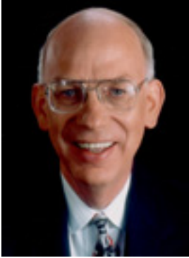
Senator Bob Bennett