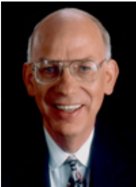
Senator Bob Bennett

Former Assistant Secretary for Lands and Minerals