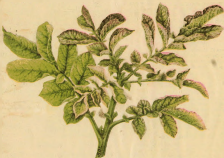
Characteristic terminal leaf symptoms of "psyllid yellows." Note the basal curling of the leaves and light green coloration.

COLORADO AGRICULTURAL COLLEGE COLORADO EXPERIMENT STATION FORT COLLINS