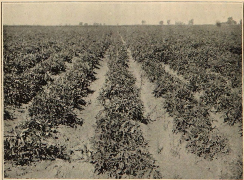
Field of Brown Beauties severely injured by psyllids.