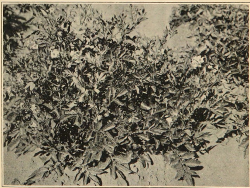
Brown Beauty plant in the San Luis Valley showing typical "psyllid yellows" symptoms. Note the curling of the leaves, both terminal and basal.

The leaves are harsh and have a peculiar rustle when brushed with the hand. The plant remains in an inactive state of growth for a period of several weeks. There is no wilting even under excessively dry conditions. In the advanced stages the yellowing becomes more pronounced and the plant turns brown and dies.