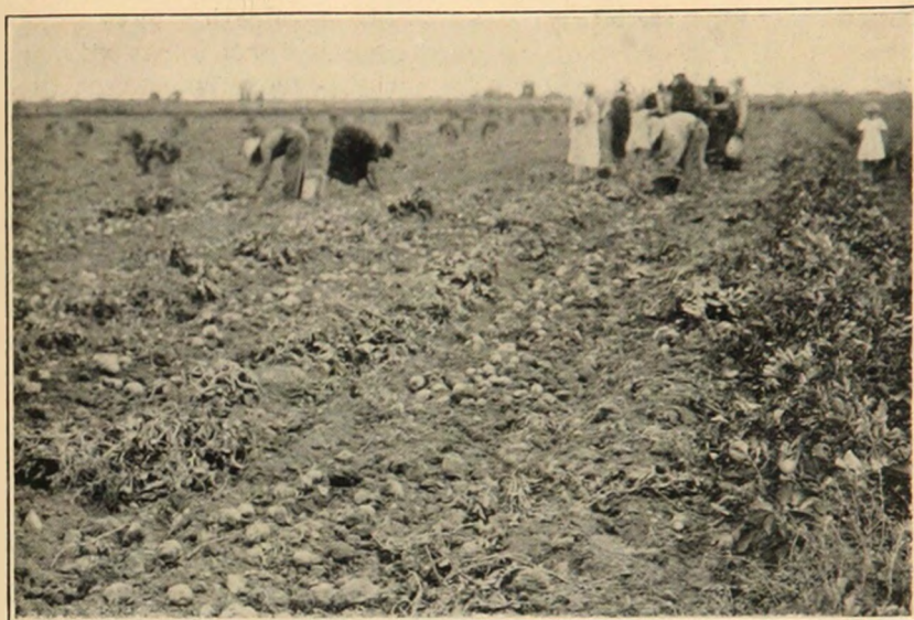
Favorable results from spraying in the Gilcrest area, where extremely heavy losses have been incurred in past years from psyllids.

in yield in the late sprays was considerable. A plot of Triumphs receiving one late application, produced 416.91 bushels per acre, or an increase of 159.04 bushels over the untreated plot. In a similar treated plot of Rurals the yield was 318.7 bushels per acre, or an increase of 120.7 bushels over the untreated plot adjacent to it.