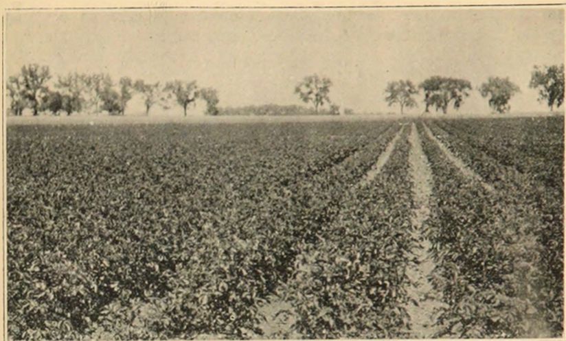
A field of Rurals in the Greeley area, showing psyllid injury. The growth has been checked and the plants were in serious condition of retarded growth.

bushels per acre, while the sprayed plots adjacent to it gave the following figures: Lime-sulphur 1-30, 296 bushels; 1-40, 378 bushels and 1-50, 302 bushels. The lime-sulphur 1-40 showed an increase of 249 bushels or 193 percent over the untreated.