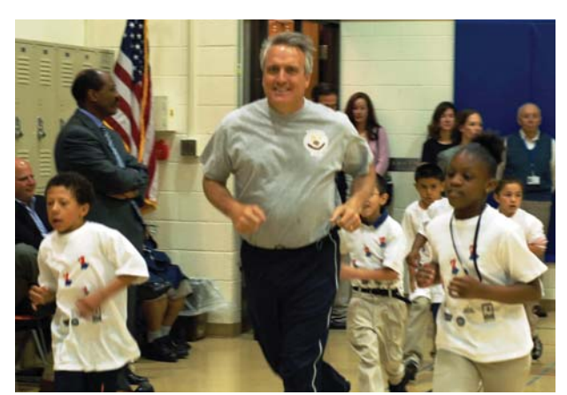
Governor Ritter encourages kids to stay healthy and active.

In order to achieve these goals all stakeholders – providers, consumers, businesses, payers and the state – must play an active role in reform and accept responsibility for improving the system. The participatory nature of health reform thus far has been essential to our success and will continue to be as we push ahead with this work.