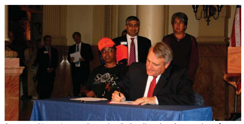
Governor Ritter signs an Executive Order directing the creation of an Olmstead Plan to reduce barriers to community-based services for disabled Coloradans.

Retain and build upon the strengths of our public/private health care system, recognizing the important role of