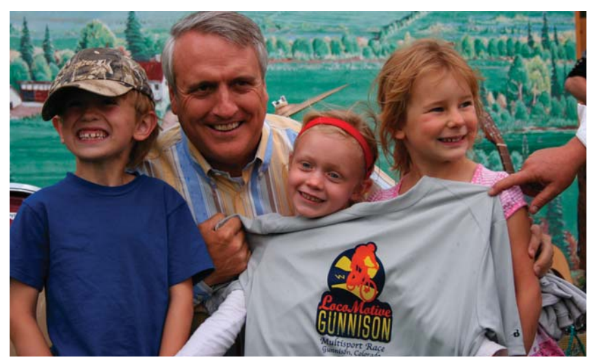
Governor Ritter celebrates the Gunnison LocoMotive Race with local kids.