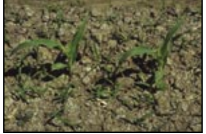
Foxtail seedling in corn