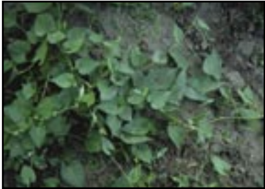
Wild buckwheat