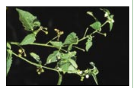
Hairy nightshade