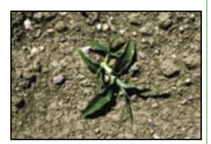
Johnsongrass seedling