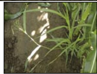
Wild proso millet