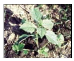
Toothed spurge

Shattercane ( Sorghum bicolor ) is an annual weed thought to have developed from outcrossing of sorghum with Johnsongrass. It is found in irrigated areas in eastern Colorado. Shattercane is a grass with long (1 to 2 feet) wide leaves and an erect stem. The plant can grow up to 12 feet high and reproduces by seeds that are black in color. Rotating to small grains, alfalfa or perennial grasses will help control shattercane.