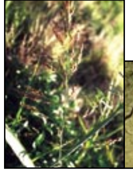
Barnyardgrass Left photo Lair Right photo P. Westra

Rotate weedy fields to a crop that is more competitive against your major weed problem. For example, going from corn to a solid-seeded forage legume such as alfalfa can effectively reduce wild proso millet.