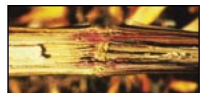
Gibberella stalk rot