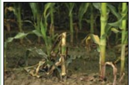
Stalk rot damage