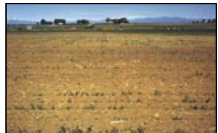
Damping-off damage to corn stands.