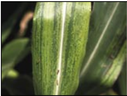
High Plains disease