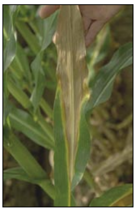
Nitrogen deficiency in corn. Appearing first on older leaves, yellowing starts at leaf tip and moves towards the base in a "V" pattern down the midrib.