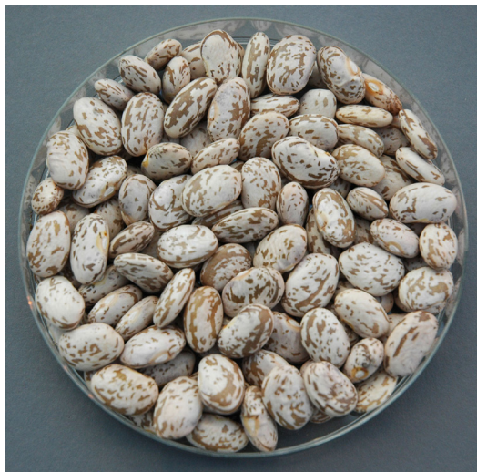
Figure 1. Example of the excellent seed quality of a slow darkening line harvested from a CSU trial at Lucerne in 2014.

Last year, I reported on our breeding efforts to develop pinto bean varieties that possess the “slow darkening” (SD) trait. The SD trait is inherited as a single recessive gene and provides a bright cream background color and slows the darkening process during storage (Figure 1). Slow darkening pinto varieties have been released in Canada and Mexico, however, those varieties are not adapted to Colorado and have unacceptably small seed size for the premium pinto markets that Colorado targets. Because other states are also in the process of developing SD bean varieties, it is imperative that Colorado develop slow darkening pinto varieties for our region.