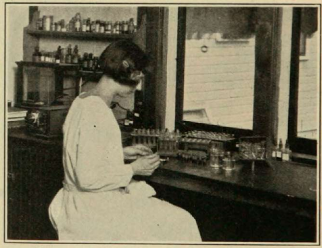
Testing Blood in the Laboratory Gives Definite Results.

COLORADO EXPERIMENT STATION Agricultural Division Fort Collins