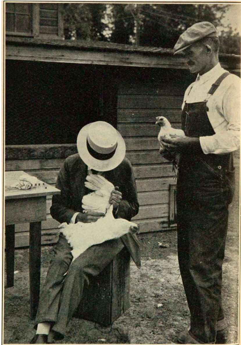
Half a vial of blood is caught for the test.