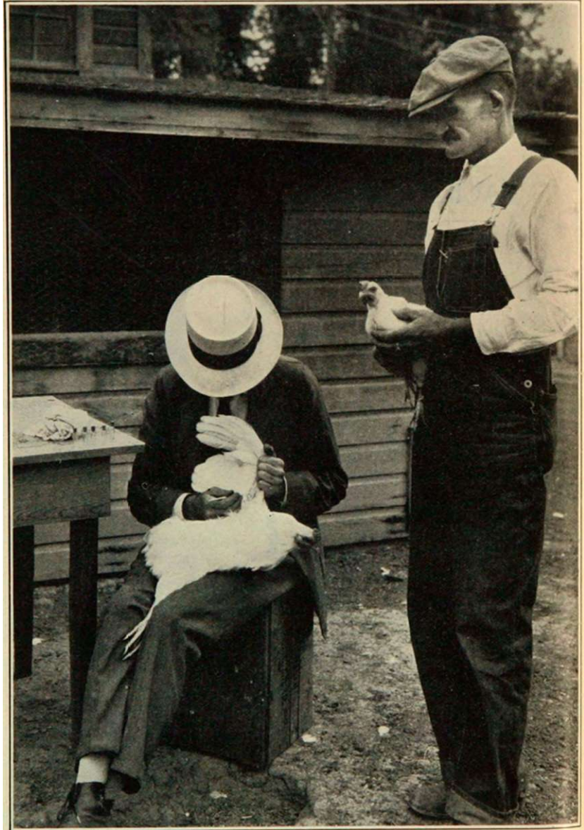
Making the incision at the point where the vein passes over the first Joint away from the body.