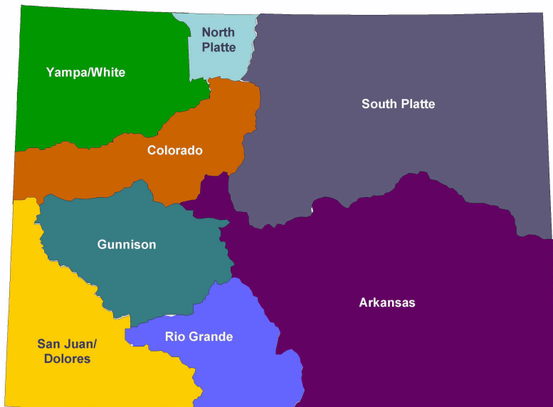
Figure 1 Colorado's Eight Major River Basins

SWSI has examined current water use and supply and has also estimated future water needs based on a per capita water use methodology. Per capita water use was