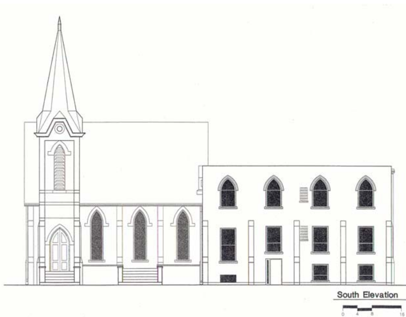
Smith's Chapel, Denver State Register

If you have questions or wish to obtain Colorado State Register nomination materials, please contact the State Register Coordinator in the Office of Archaeology and Historic Preservation at 303-866-4681.