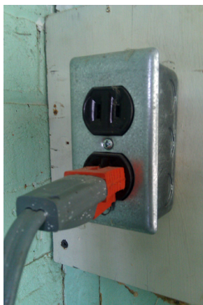
Figure 3. Some outlets require use of a 3-prong adapter to host a power monitor.

Note that the worksheet consists of two 'tabs'—General Rate and Time-of-Use. For most residential customers on a flat rate, the general rate tab will be sufficient for understanding your current and potential electricity uses and costs. For those under a TOU rate or for those interested in analyzing electricity use and cost under