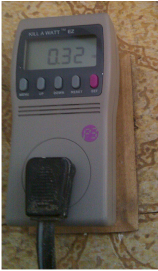
Figure 2. A power monitor in use.