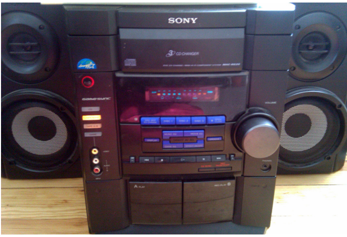
Figure 4. This stereo uses 15 watts when 'off' under a certain display setting.

It is best to capture the cycling of these active and passive stages over a representative period of time as is done with refrigerators and water heaters. A less accurate means of calculating wattage when 'on' would be to record the most common wattage (active or passive) or take the average of the active and passive wattages, if they are not too far apart.