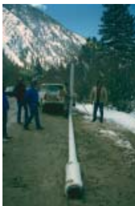
Construction of a dry hydrant system.

community water system. Cooperation with your neighbors can result in the development of a common emergency water storage facility to provide protection, not only for your home but for others. Finally, as a last resort, you may need to develop your own well.