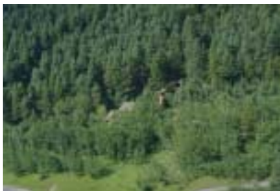
Probably not a wise location for a home.