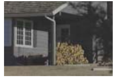
This home might not survive a wildfire.