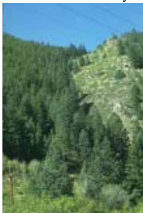
This location would become a natural chimney during a wildfire.