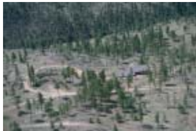
This home is more easily defensible.