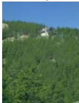
A disaster waiting to happen.

Your first defense against wildfire is to create and maintain a defensible space around your home. This does not mean your landscape must be barren. A defensible space is an area, either man-made or natural, where the vegetation is modified to slow the rate and intensity of an advancing wildfire. It also creates an area where fire suppression operations can occur and helps protect the forest from a structure fire.