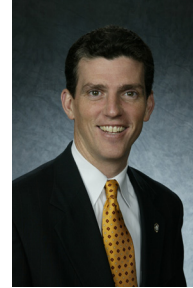
Attorney General Patrick Lynch

As co-chairs of the Task Force on School and Campus Safety formed by the National Association of Attorneys General (NAAG), we are pleased to present a report and recommendations for your consideration. With assistance from nationally recognized experts in the field of school and campus security, the Task Force examined a number of issues that have again been thrust upon the public consciousness as a result of the recent tragedy on the campus of Virginia Tech and incidents of violence at schools across the country.