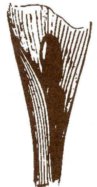
Figure 2: Aphid eggs deposited on a leaf (enlarged).

Ants often are attracted to honeydew and feed on it. Ants may even "tend" aphids and other honeydew-producing insects (certain scales, leafhoppers, treehoppers), protecting them from natural enemies such as lady beetles and lacewings (see fact sheet 5.550, Beneficial insects and other arthropods ). Often the presence of ants crawling up trees or over foliage indicates that large numbers of aphids or other honeydew producers also are on the plants.